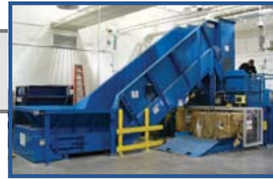
Small 2 Ram Baling System at Government Facility