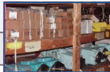
Large Parts Inventory