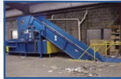
Full Eject Baler Installation at Folding Carton Plant