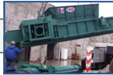
Large 2 Ram Baling System for Non-ferrous Scrap